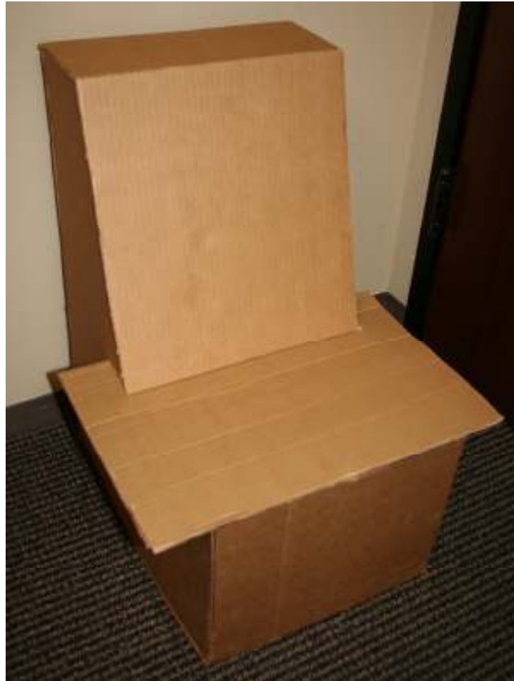
Yay! It's finally done!