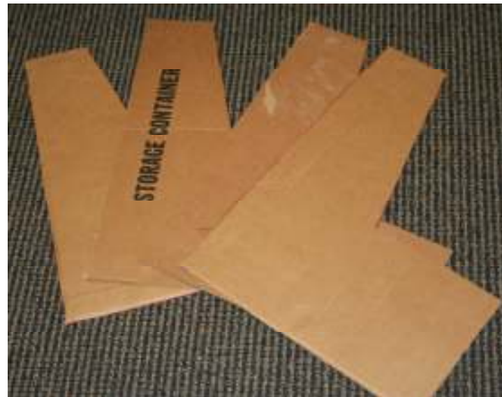
These pieces will eventually form the sides.