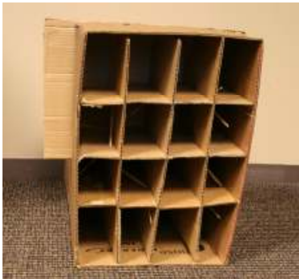
An undershot of the finished product.

This DIY project brought to you by Earth911.com . Each month, we'll feature a new Reuse Challenge, where we make something from recyclable materials and challenge you to do it better! Think your project is awesome? Send us your photos & info!