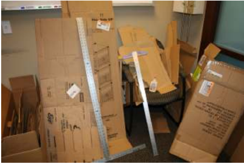
Here's what we started off with: some wood glue, a T-square and lots of cardboard.