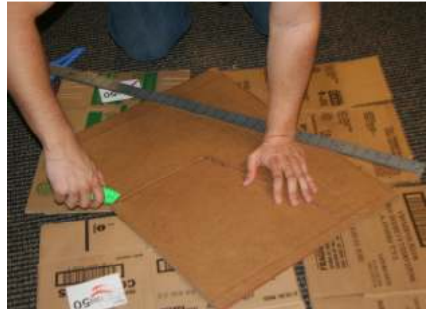
Cutting on scrap cardboard saves your worktop from being scratched.