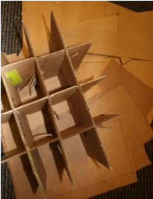
All our cut pieces, and the grid is assembled.